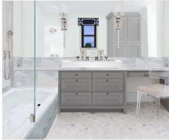
OPTION 2: EXISTING TUB + TOILET IN WHITE MARBLE NEW VANITY W/MAKE-UP

COST ESTIMATE: $20-35k depending on option + tile & fixtures ($4K+)