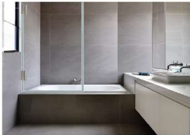
MODERN VERSION OF SAME PLAN