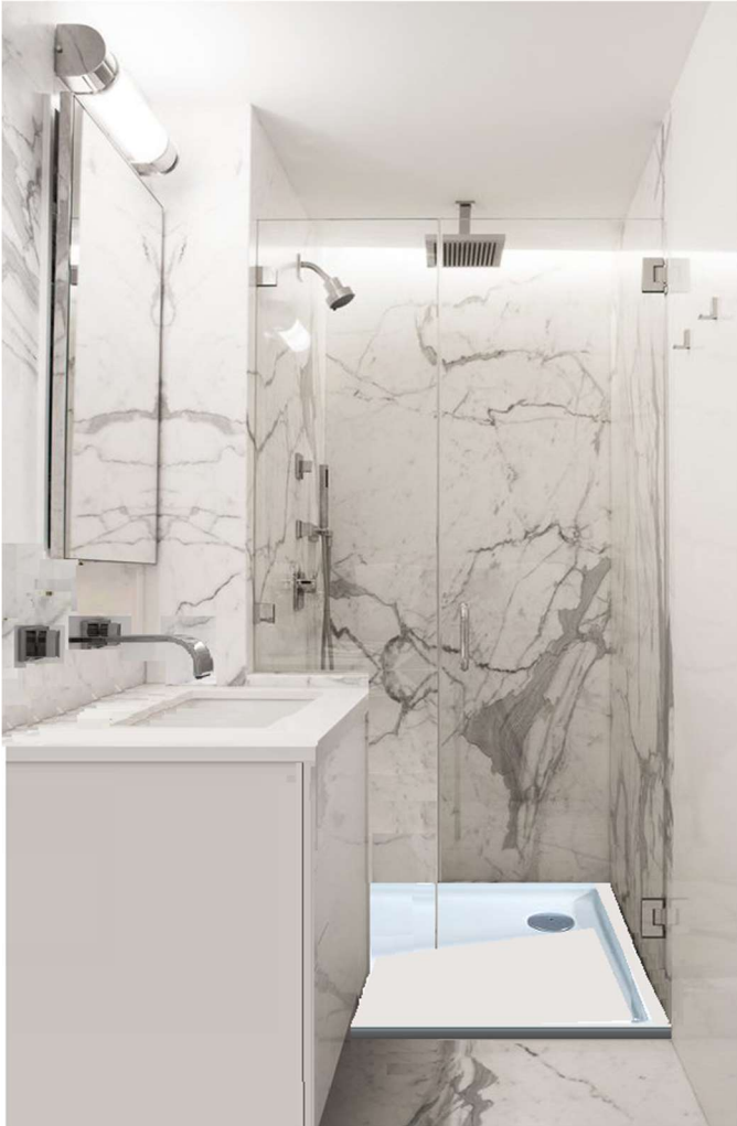
BATHROOM RENDERING FOR FINISH OPTION #1: MODERN IN LARGE FORMAT WHITE MARBLE