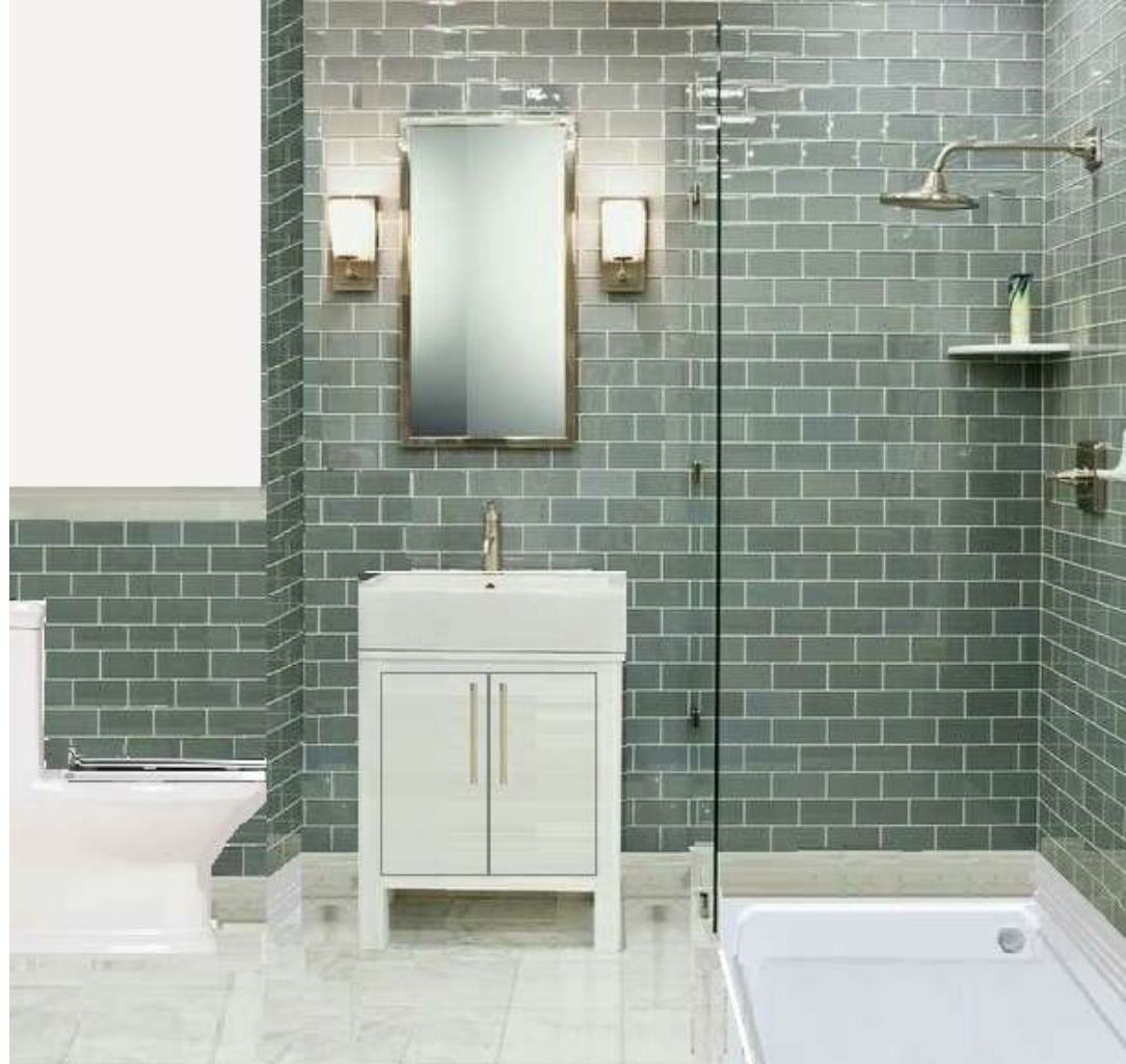
BATHROOM RENDERING FOR FINISH OPTION 2: TRANSITIONAL GRAY SUBWAY TILE W/WHITE MARBLE FLOOR