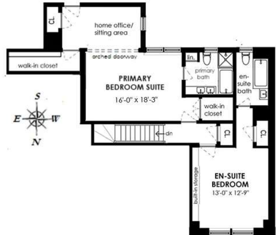
new primary suite plan

Beautiful Listings. Beautifully Presented. Beautiful Results. #BeautifulNYC