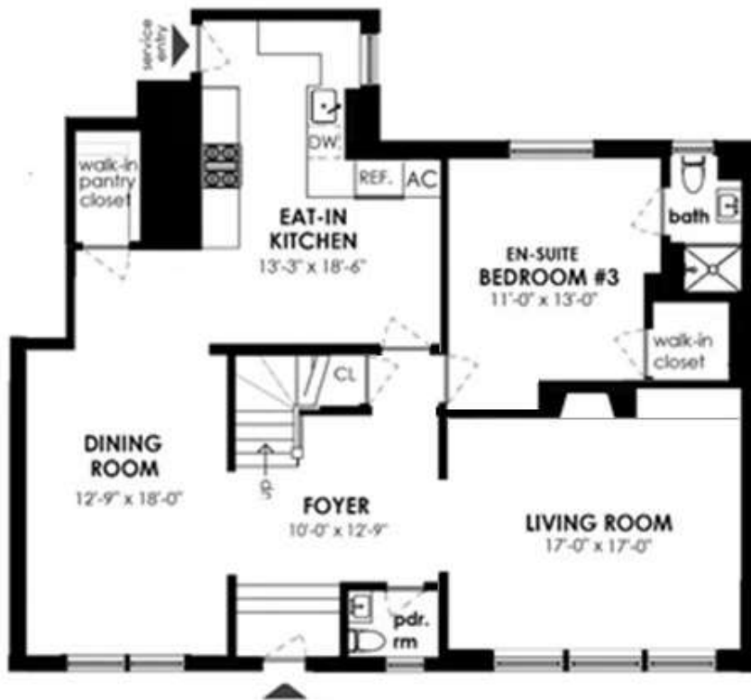
new first floor plan

Key Features: New 1st floor Bedroom Suite with full bath; Living Room feature wall with direct vent ethanol fire place; and Modern, enlarged 2nd floor Primary Suite with enlarged 5 piece bathroom, 2 walk-in closets and home office/sitting room