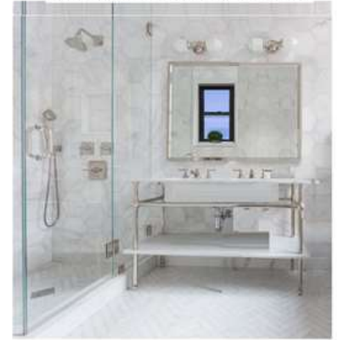
OPTION 3: STALL SHOWER & VARIATIONS ON VANITY + STORAGE CABINERY